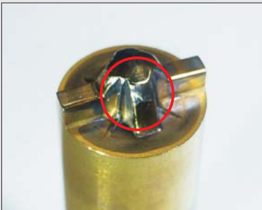
Flaking/chipping on the surface